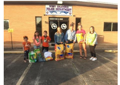
The lemonade stand raised $180 which was used to buy supplies for the local dog pound.