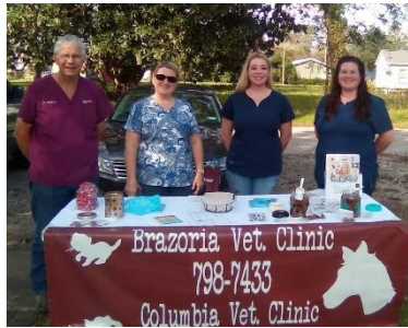
The West Columbia Vet Clinic provided information and gifts for those that were present.